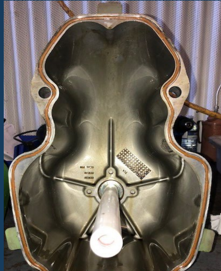
Infineum M8220 in Grp II