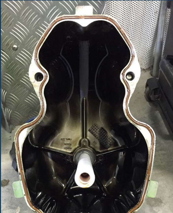
Market General product in Grp II