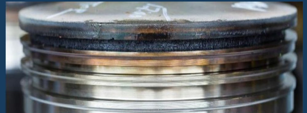
Infineum M8220 in Grp II