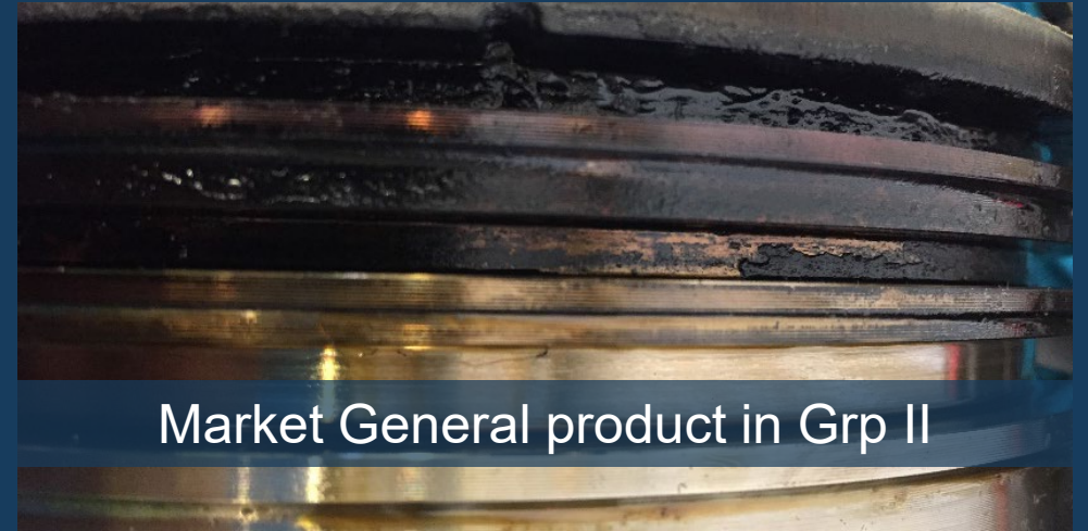
Market General product in Grp II